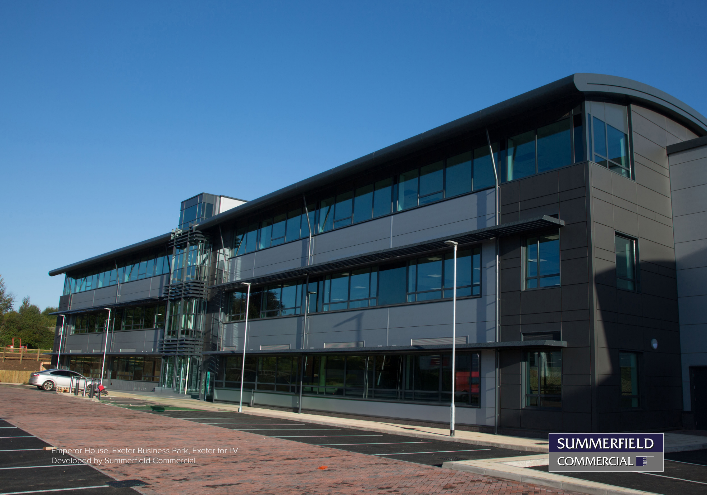
Emperor House, Exeter Business Park, Exeter for LV Developed by Summerfield Commercial