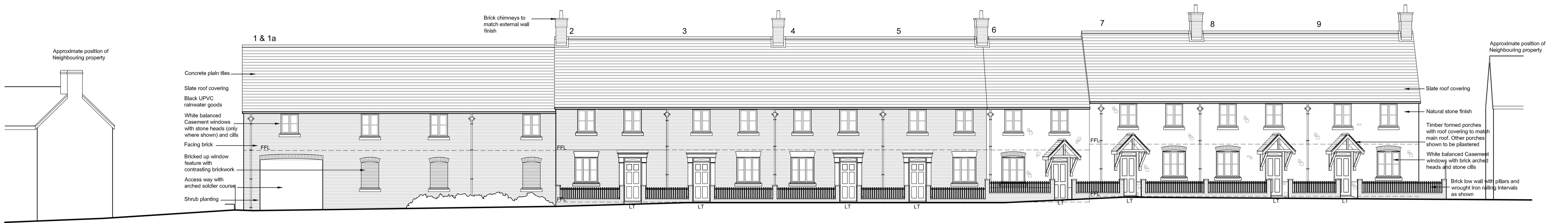
NORTH FACING ELEVATION 1/100