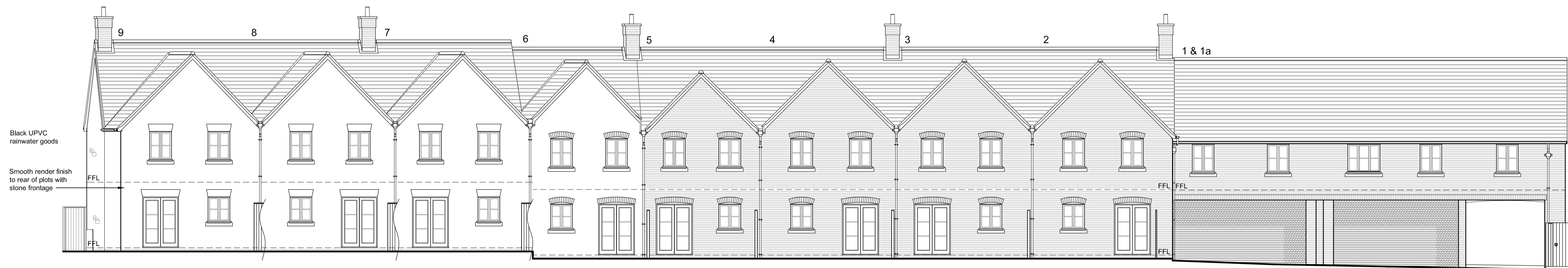
SOUTH FACING ELEVATION 1/100