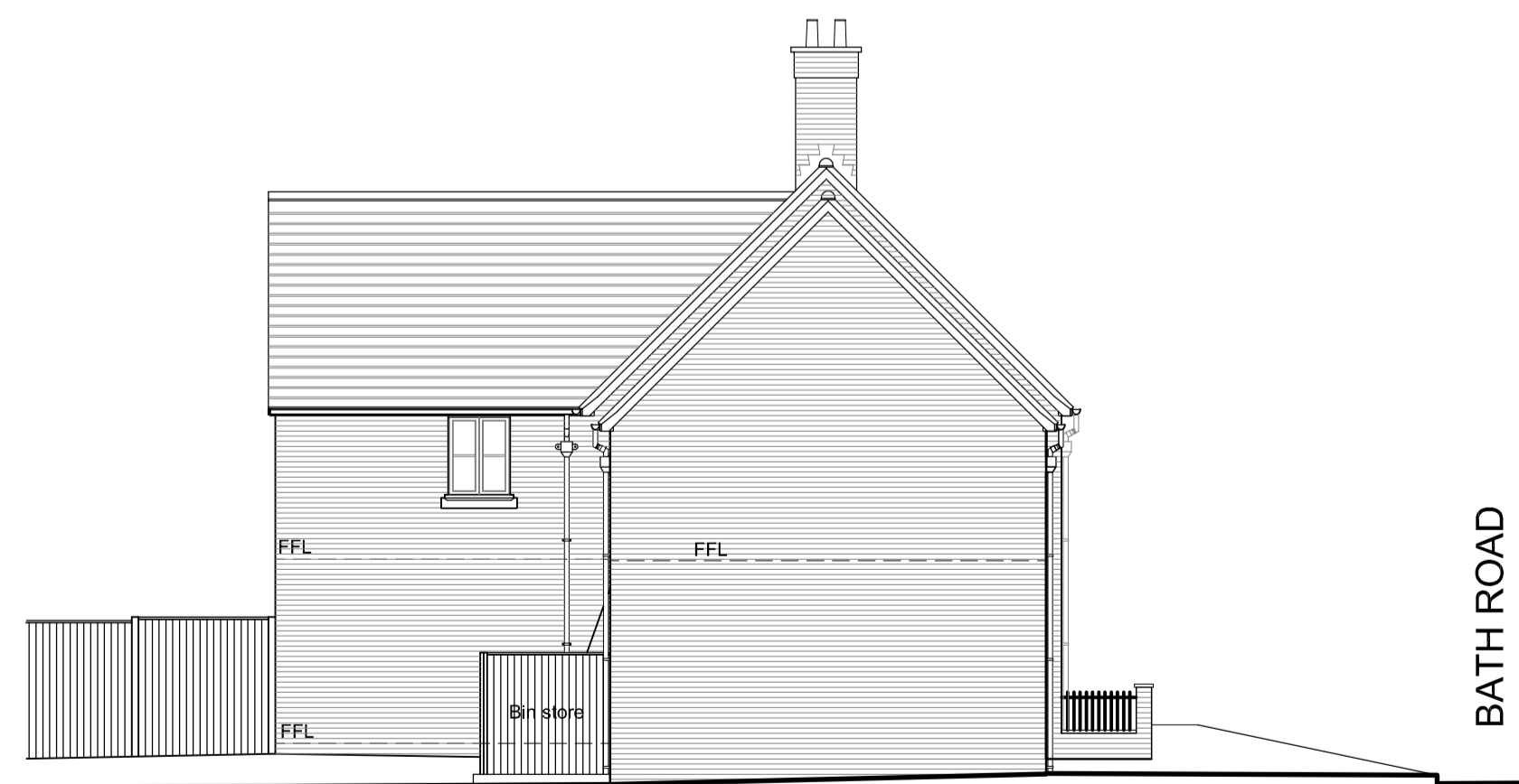
EAST FACING ELEVATION 1/100